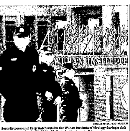
Security personnel keep watch outside the Wuhan Institute of Virology during a visit by the World Health Organization team in February.