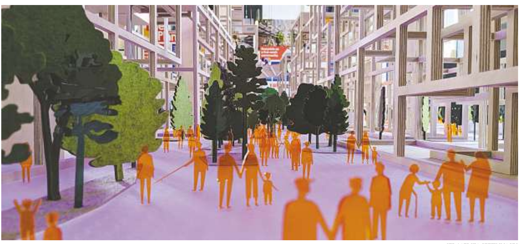
Depicted is a model of a futuristic neighbourhood on Toronto's waterfront. Toronto authorities agreed in principle Thursday to move forward with a controversial project by a subsidiary of Google parent-company Alphabet to create a sustainable community at the foot of Parliament Street.

as the U.S.-Mexico-Canada Agreement, or USMCA. "If we can come to terms, (which) I think we're close to doing, this will be a template for future trade agreements - it will not only be good of itself, but a good pattern for how we can proceed," Pelosi said. "We're not there yet, but we understand the road - the last, shall we say, mile that we have to go. I'm optimistic." The Canadian Press