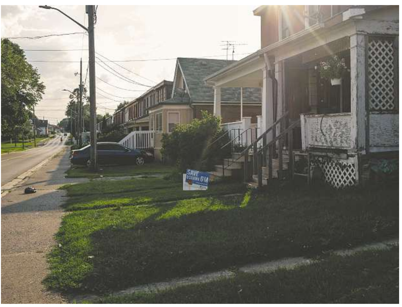
LAURENCE BUTET-ROCH FOR BLOOMBERG